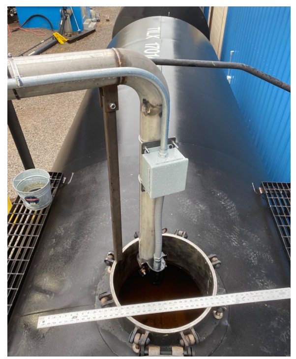
Radar Level Transmitter on Swivel Loading arm

During filling the loading arm swivels out from the railcar loading platform to be positioned over the railcar. When the railcar is 75% full a relay turns off the pump to prevent the railcar from overfilling.