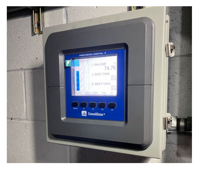
PD9000 ConsoliDator+ in a PDA2909 NEMA 4 Wall/Field Mount Enclosure (Note: Picture Taken Before Setup Complete)

The relay outputs are used to provide high and low level alarms for the two storage tanks, and to turn off a pump when the railcar is 75% full. The railcars are filled manually beyond 75% full if desired.