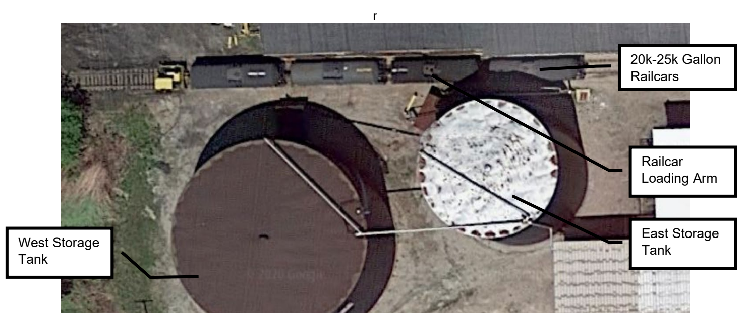
Sugar Mill Molasses Tanks and Train Cars Lined up for Loading