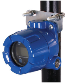
PDA6863-SS Pipe Mounting Kit for 2" Pipe