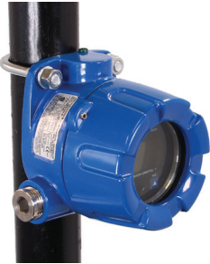
PDA6631-SS U-Bolt Kit for 1.5" Pipe