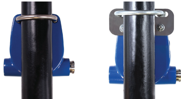
Figure 1: Rear Views of PDA6631-SS (left) and PDA6863-SS (right) Both Mounted on 1.5" Pipe