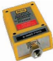
Beta Port Module

For the ultimate in pressure measurement, performance, and flexibility, the PD9500 calibrator has been designed to accept pressure modules from three different manufacturers, including: BETA, Fluke, and Mensor. Modules are available in up to 29 ranges and types including gauge, vacuum, absolute, differential and compound. Modules are available from 10" water column (WC) to 10,000 PSI full scale.