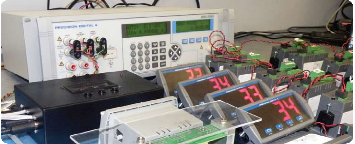
The PD9500 Calibrator in Action

The PD9500 calibrator is used in Precision Digital's manufacturing operation. The calibration process is automated, and commands are sent to the PD9500 calibrator via the RS-232 serial port. RTD, thermocouple, mA, and voltage inputs are calibrated in one program.