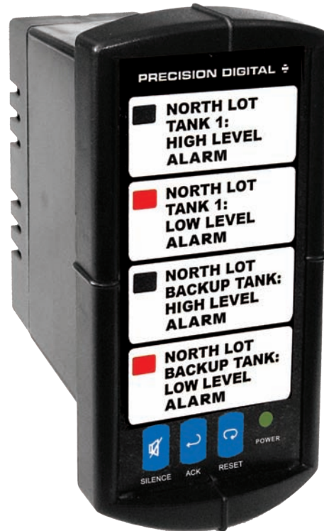
Model PD154 / 4-Point